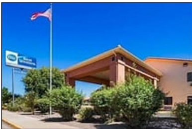
Best Western Hotel & Suites 1100 N California St. Socorro NM

Tell them you are with the NM Fire and EMS Expo!