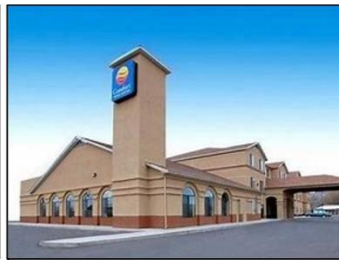
Comfort Inn and Suites 1259 Frontage Rd. Socorro NM