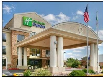
Holiday Inn Express 1040 N California St. Socorro NM