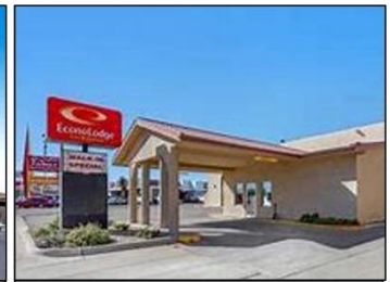
Econolodge Inn & Suites 713 N California St. Socorro NM

The hotels above have room blocks for attendees of NM Fire and EMS Expo. Note other hotels are available in Socorro. Booking your hotel room early before a conference is a smart move for ensuring you secure the best accommodation at a competitive rate. Early booking gives you access to a wider selection of rooms and locations, often with better prices and more favorable terms. It also provides peace of mind, making your conference experience smoother and more enjoyable.